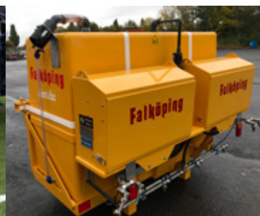
Liquid spreader CLT-1.8/2.1