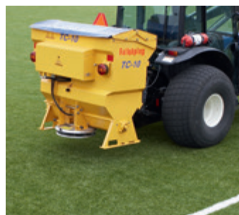
De-icing of artificial turf.